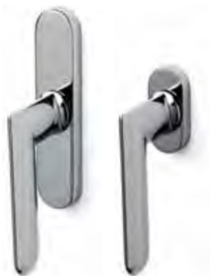
C150R - fixed window slider